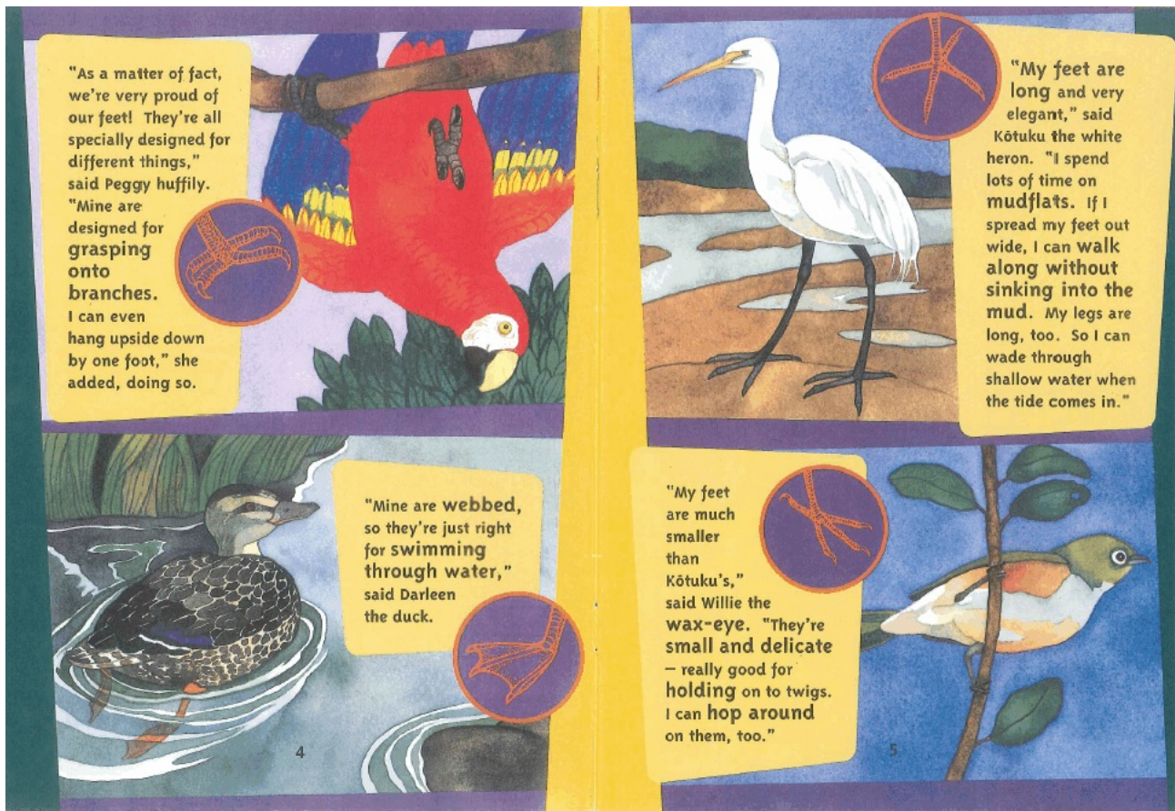
"Feathery Friends" by M B Takaro, Connected 1, 2001 (Learning Media)

Searching the science bank using the keywords 'adaptations' AND 'birds' will provide you with a list of classroom tasks to choose from, depending on your students and their needs. Feet and Beaks (LW0501) and Feet and beaks II (LW0643) are two resources that provide a choice of strategies for exploring the same idea (pencil and paper or a card matching activity). Other resources include Bird Feet and Beaks (LW0559) and Beaks (LW0631). All these resources can be used in a variety of ways to support teaching and learning, including formative assessment.