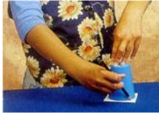
Draw around the cup to make a circle on the cardboard.

Look at each picture and write an instruction to go with it. The first one has been done for you.