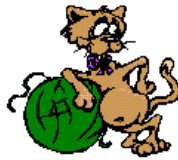
Cats taken to the vet in one week