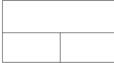
Plan of the Garden

ii) What fraction of the garden did Aroha weed? _____