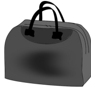
Bag B $105