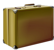
Bag A $201