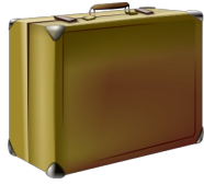
Bag A $201