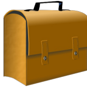
Bag D $210