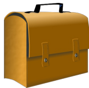
Bag D $210