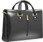
Bag C $150