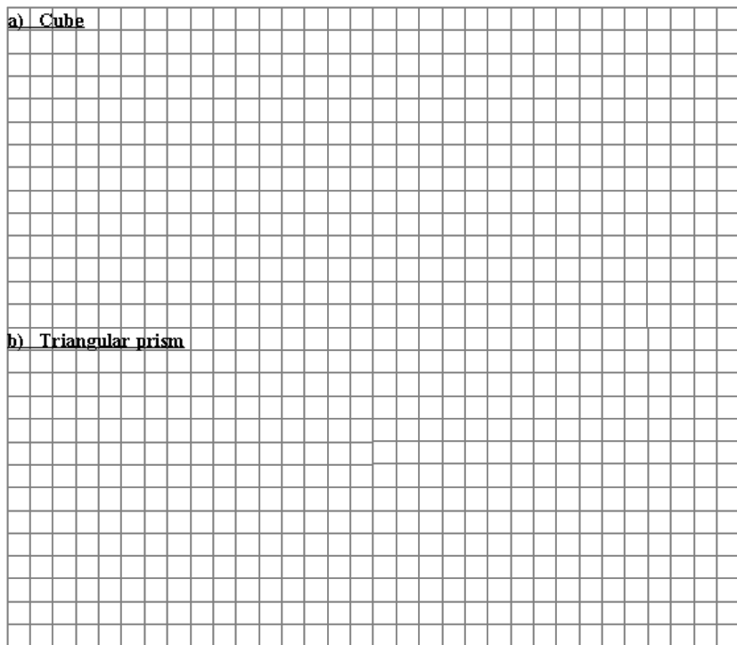
Template of Cube

Draw an accurate picture of each shape in the box below.