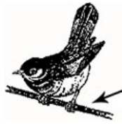
line carrying 11,000 volts

This task is about conducting electricity and safety.