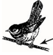
line carrying 11,000 volts

This task is about conducting electricity and safety.