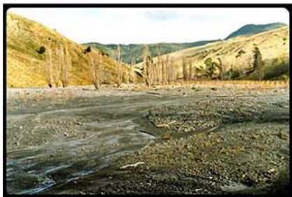
Before tree planting programme

The first photograph shows an area before a tree planting programme was started, and the second photograph shows the same area 5 years later.