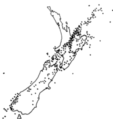
Focus of earthquakes

This task is about interpreting a map showing earthquakes and tectonic plates.