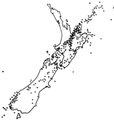
Focus of earthquakes

This task is about interpreting a map showing earthquakes and tectonic plates.