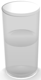
glass of water