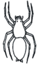
legs - C