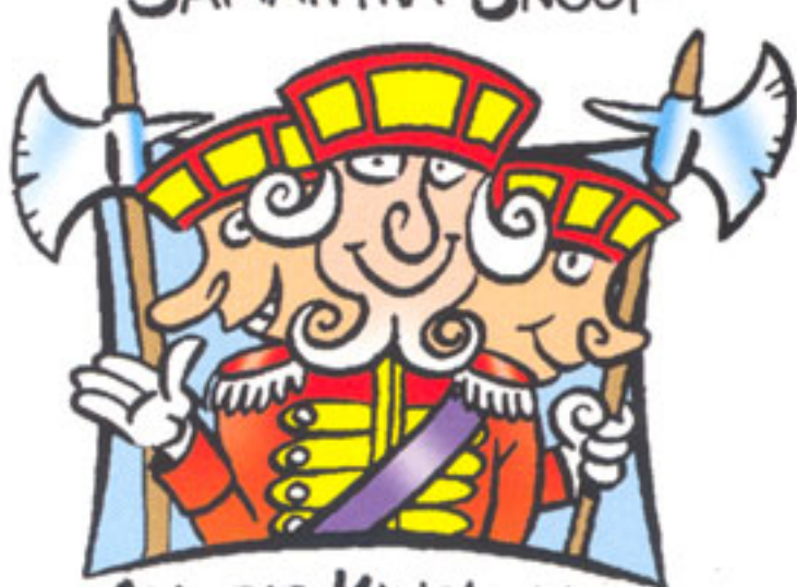
ALL THE KING'S MEN